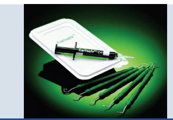
[Table/Fig-2]: Multi-mix Carisolv gel and instruments

c.Tropocollagen unit to form collagen fibril. Red arrows depicts the site for cleavage at intra- molecular cross linking as modified from Dow et al., 1996