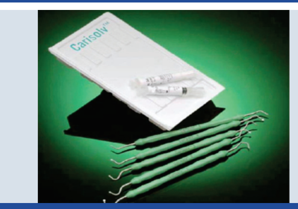
[Table/Fig-3]: Single mix Carisolv gel and instruments